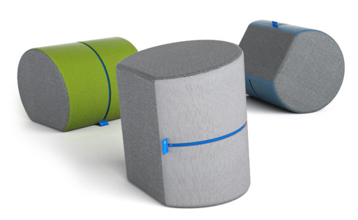
RockerOtt.10™ Seat AVAILABLE IN: